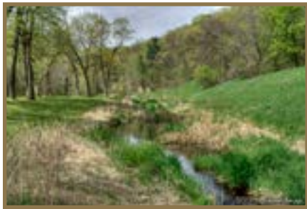
"Battle Creek Regional Park" by TBoard is licensed under CC BY-NC-ND 2.0.

There one can see a huge pipe disgorging a slurry of dredge sand and water being molded into an ever-increasing new island by bulldozers and other heavy equipment. These planned seven new islands will stabilize shorelines, help restore wetlands, and improve wildlife habitat. Signs at the launch site list the work is being done by Brennan: Marine Professionals since 1919. They are employing drag-lines to fill barges with dredged sand from further south on Pigs Eye Lake's channel to the Mississippi River. The loaded barges are then pushed to an awaiting moored platform barge with a huge clam shell excavator. It takes giant