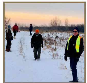
Pig's Eye Park Friends hike in January 2022

To see the wonders of Pig's Eye contact Tom Dimond (tdimond@q.com) or check out Pig's Eye Park Friends Facebook page for weekly hikes that are open to the public.