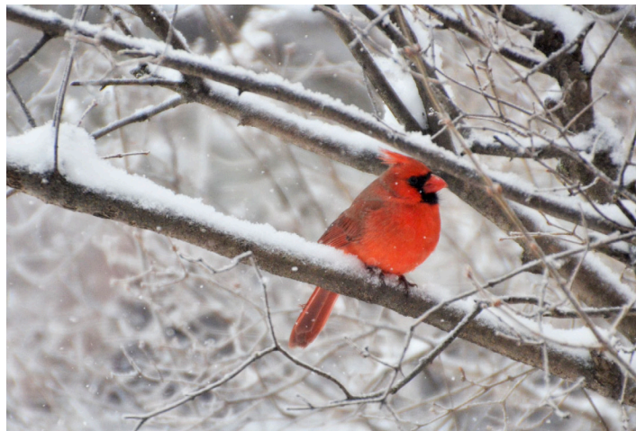
Northern Cardinal

Accessible and inclusive birding for every body! Borrow binoculars. Practice birding by ear. Enjoy the company of other birders. Go birding with a naturalist on the sidewalk around the nature center and move inside to the Observation Room where birds visit the feeders right outside the windows. All ages and skill levels welcome.