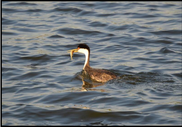
Catch a glimpse of a Western Grebe in Minnesota at the Salt Lake Birding Weekend sponsored by the Minnesota River Valley Audubon Chapter and the Minnesota Ornithologists' Union.